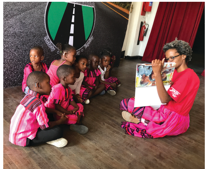
CLaSH teacher presenting the 2018 calendar to the children