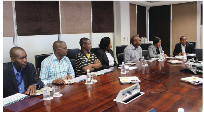
Members of the visiting Zambian delegation

The RFA shared the developments on the Namibia Road Fund legislation reforms. On their part, the Zambian delegation deliberated on their progress on tolling as well as the operational model of the Zambian road sector.