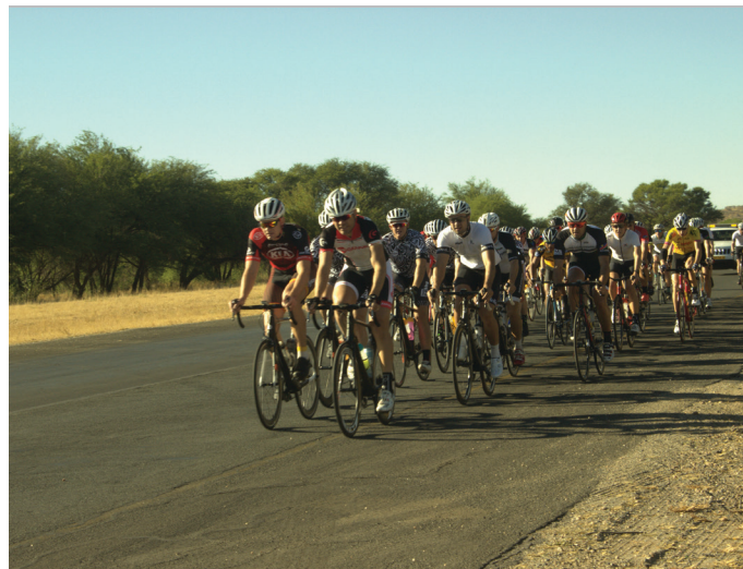
Bunch of Cyclist on the B1 road

Funds raised at this event will be used towards poverty reduction, health, food security, education, early childhood development (ECD) and the environment.