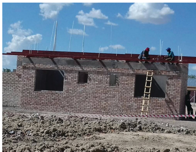
Staff housing under construction at the Kashamane Border Post

The successful completion of phase one and two led to the rollout of phase three. A total number of seventeen staff houses will be constructed between Oshikango, Omahenene, Katwitwi, Kashamane and Wenela border posts under the current phase. With the completion of phase three the total number of border post staff housing units constructed under this project will stand at fifty-six. Phase three of the housing project is envisaged to be completed between March and July 2018.