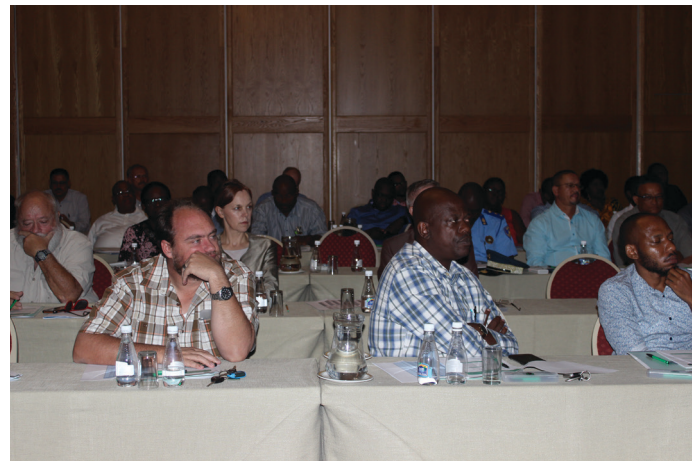
Stakeholders at the Business Plan Meeting

The funding determinations are derived from funding requests submitted by funding beneficiaries stated in the RFA Act, for road network maintenance and rehabilitation. These requests are gaged against the road master plan, national development plans, Harambee Prosperity Plan and strategic road sector priorities.